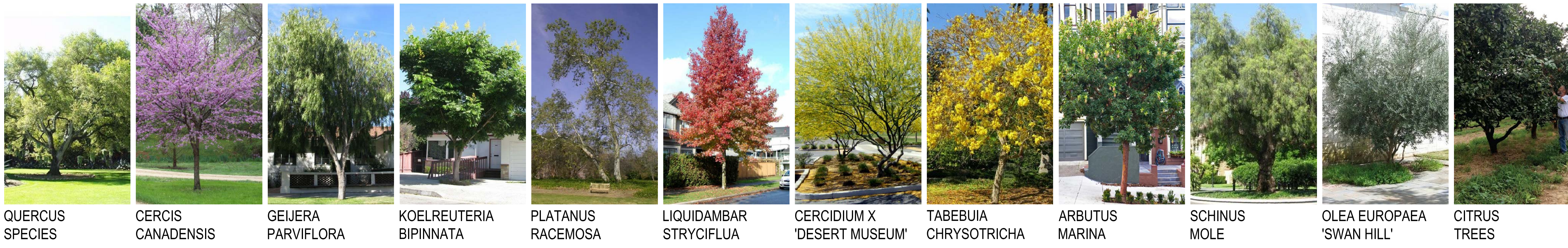
QUERCUS SPECIES CERCIS CANADENSIS GEIJERA PARVIFLORA KOELREUTERIA BIPINNATA PLATANUS RACEMOSA LIQUIDAMBAR STRYCIFLUA CERCIDIUM X 'DESERT MUSEUM' TABEBUIA CHRYSOTRICHIA ARBUTUS MARINA SCHINUS MOLE OLEA EUROPAEA 'SWAN HILL' CITRUS TREES